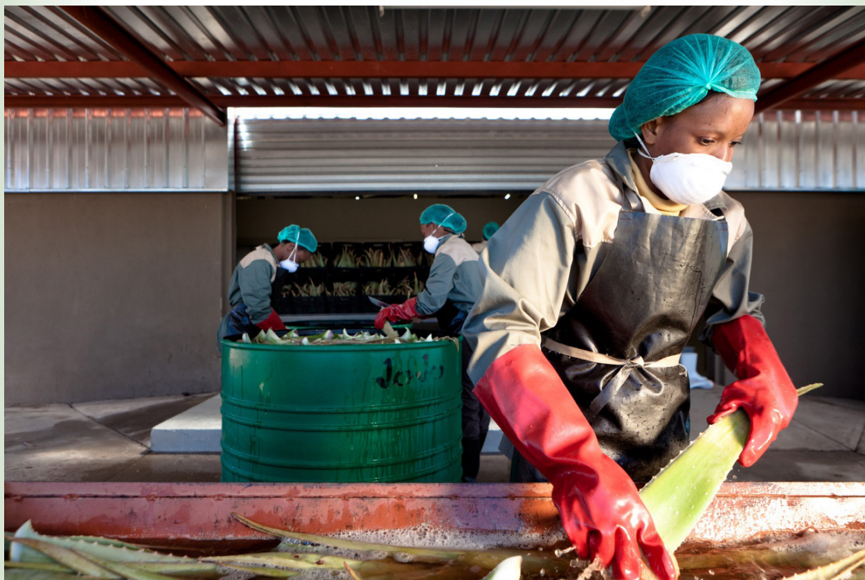
Washing of the A. vera leaves before processing