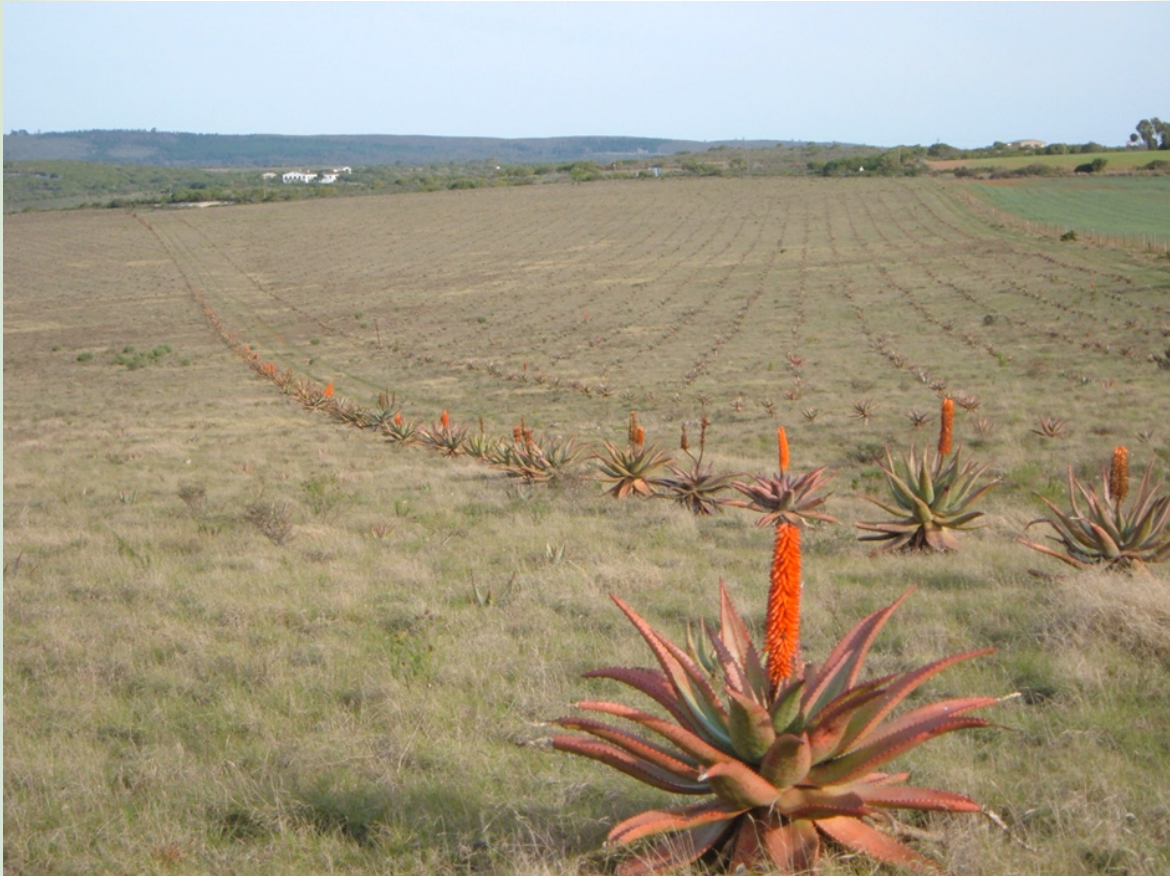
Experimental A. ferox plantation in Albertinia