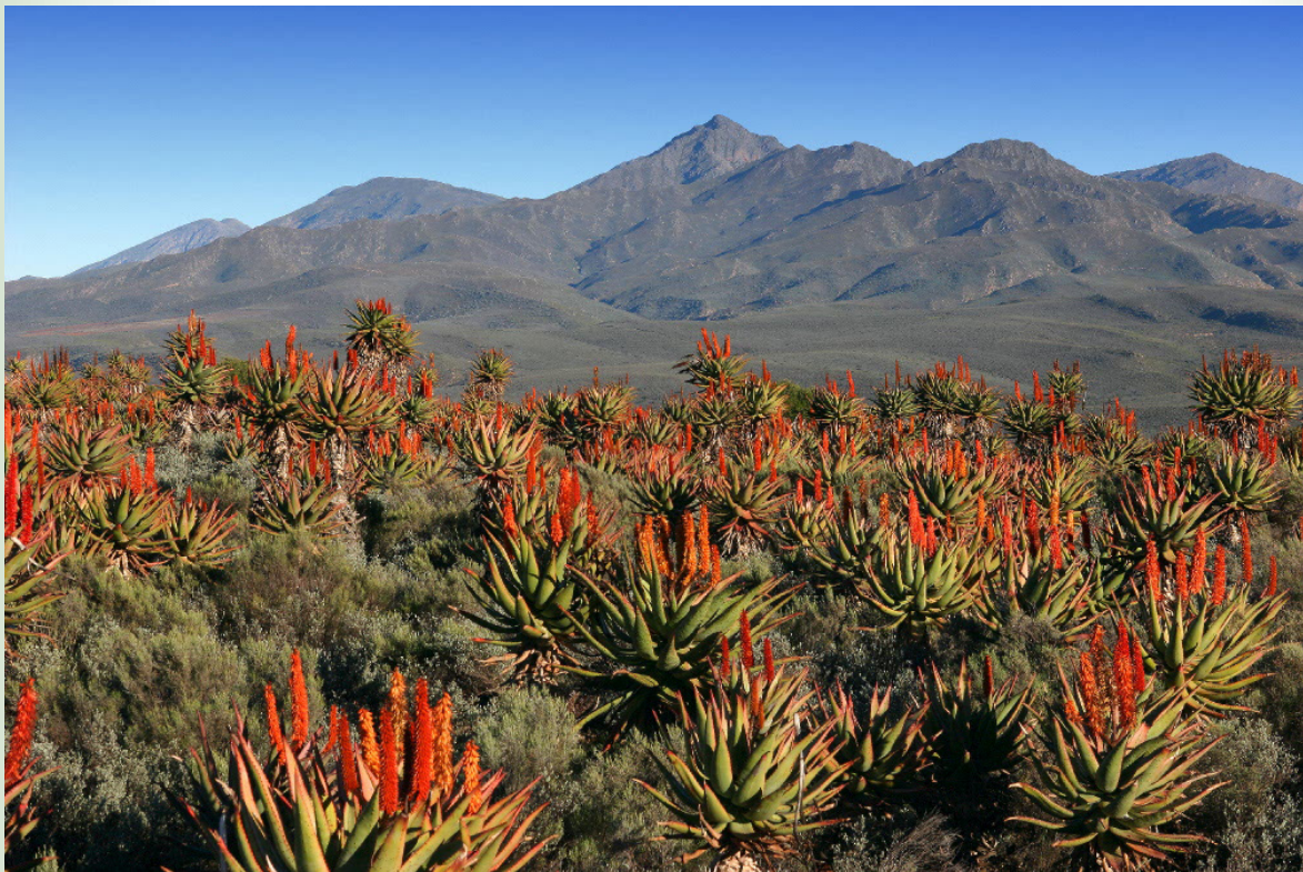
A. ferox plants in the wild at Uniondale