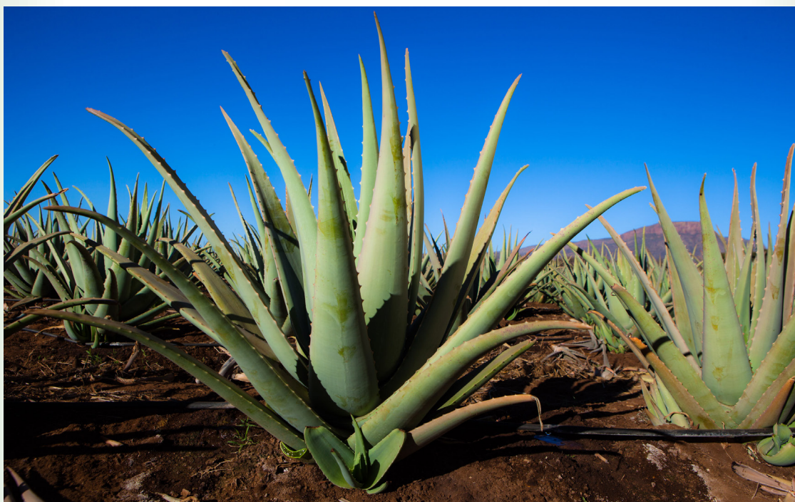
A. vera plant, South Africa

A. vera is the main species that is globally cultivated agriculturally because it yields the largest volume of inner leaf gel juice. Normally A. vera is reproduced from offshoots from the mother plant. Such offshoots could be removed twice a year. For commercial production, the identity of the plants has to be established before cultivation. Aloe species can also very easily hybridise and this could be an issue when multiple species are cultivated. The A. vera plant lasts about 8 years of commercial cultivation after which it becomes too top heavy and will topple over; then it needs to be replanted. The plant can be harvested from year two and would be a mature plant in year three.