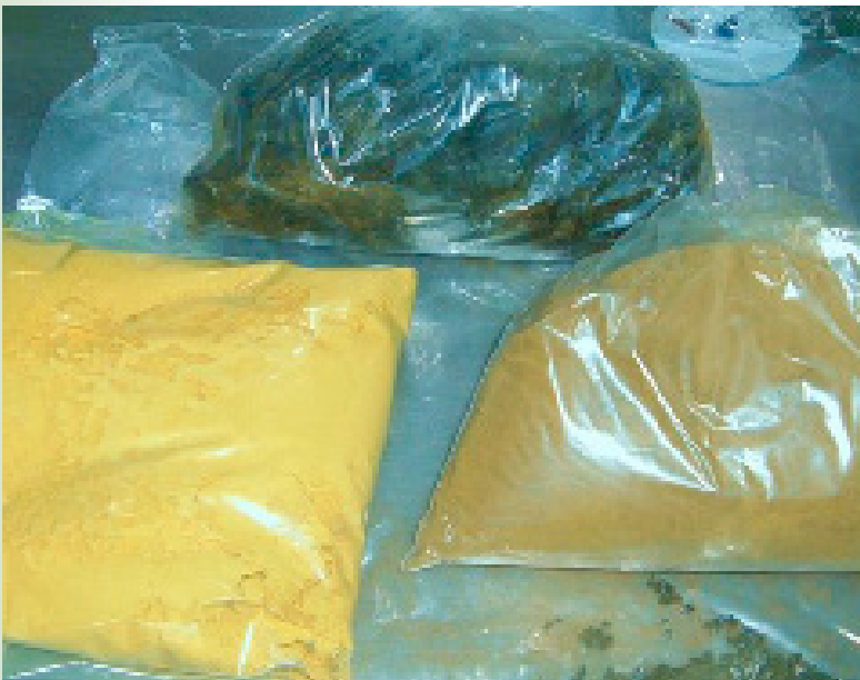
Raw material: Aloe lump (top), bitter powder (left), Lump grinded powder (right)