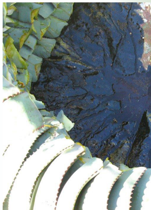
A. ferox leaves packed in a circle to drain the bitters

An A. ferox tapper tapping aloe bitters in the wild in Uniondale