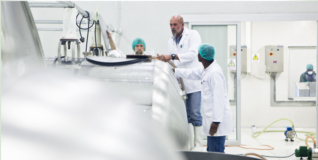
A. vera factory in Vivo, South Africa