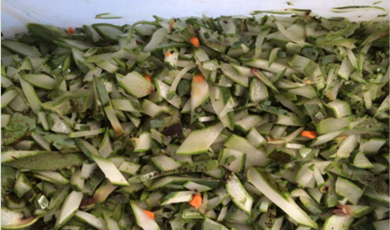
Cut pieces of A. ferox leaf for processing

count to acceptable levels. This is necessary for organic products because no other methods are available except steam sterilisation to keep bacterial counts to acceptable levels and retain all the biological activity in the whole leaf. The dried leaf is grinded and used in supplements and tea.