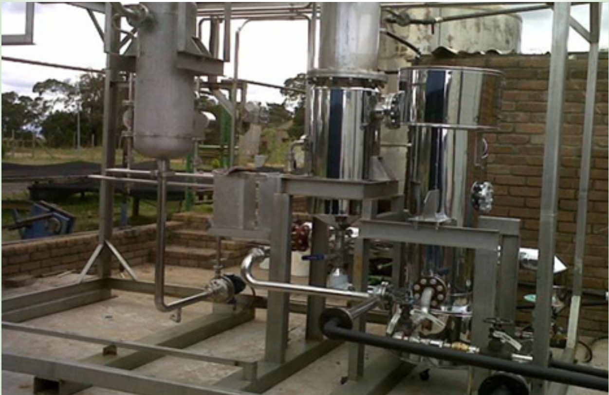
Alcohol distillation plant for producing A. ferox inner leaf gel