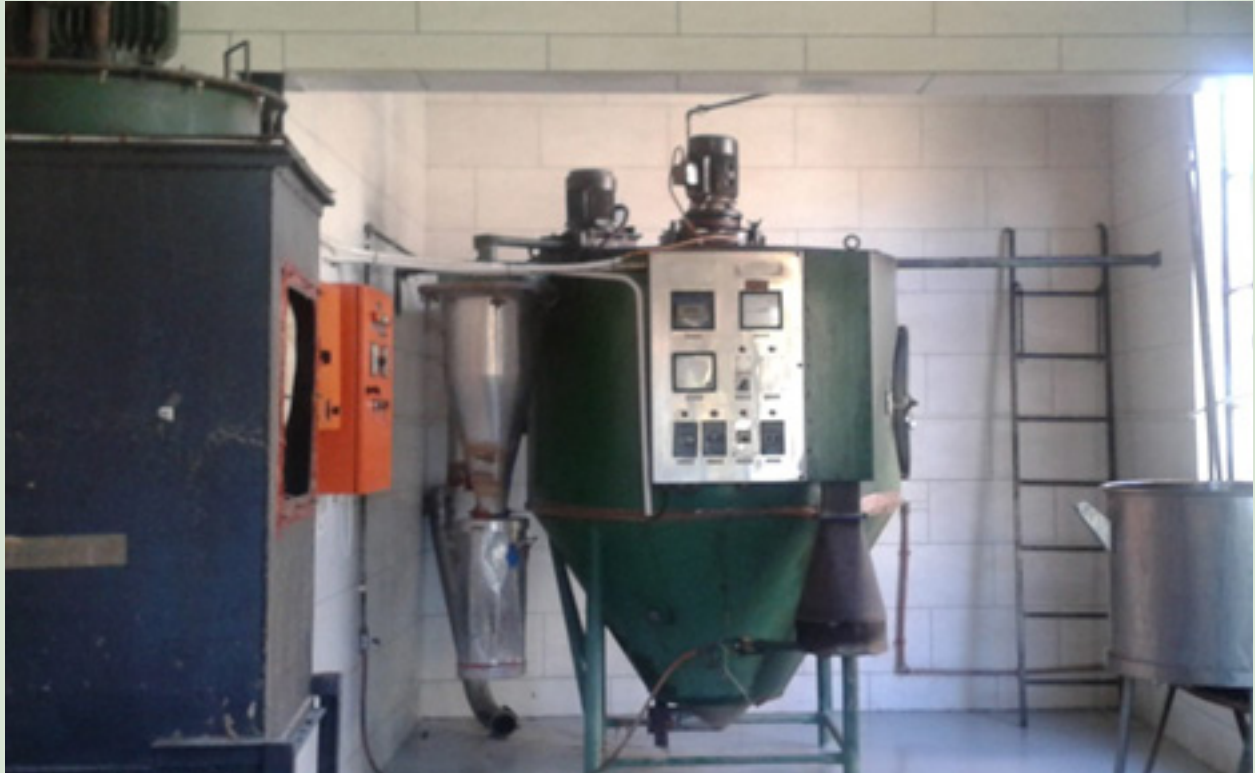
Spray dryer for spray drying aloe bitters